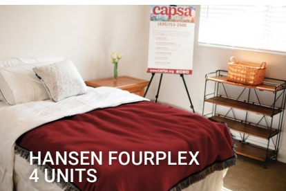
HANSEN FOURPLEX 4 UNITS