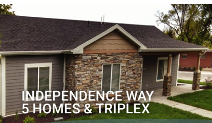
INDEPENDENCE WAY 5 HOMES & TRIPLEX