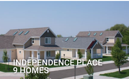
INDEPENDENCE PLACE 9 HOMES